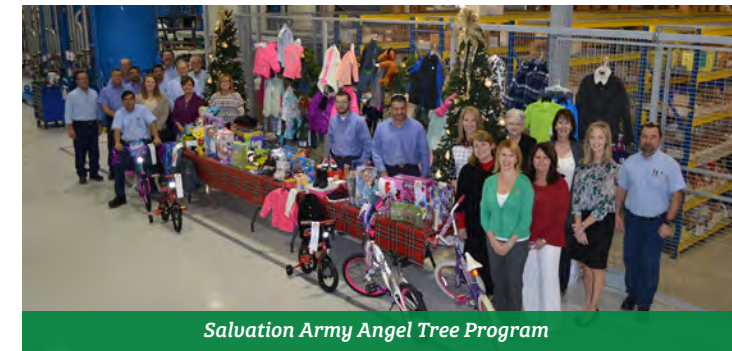
Salvation Army Angel Tree Program

Each year, Pureflow participates in various benevolent projects. We are committed to giving more of ourselves, our time, resources and love to those in need.